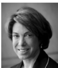
LAURA D'ANDREA TYSON